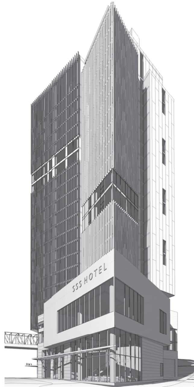
CAMERON ROAD VIEW