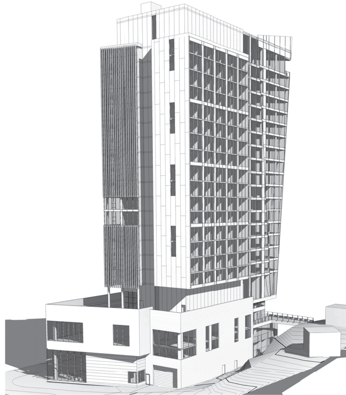
SOUTH EAST AERIAL